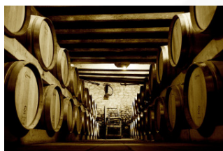
Château Frédignac barrel cellar

Château Frédignac started its organic conversion when Vincent came back to the familial estate, three years ago. 2013 will then be the first vintage organically certified (AB). Definitely a good occasion to discover the top cuvee of the Château, Cuvée Prestige, made from a selection of the best domain plots. Cabernet usually takes a larger place in the blend, leading to a complex, elegant and multi-rewarded wine !