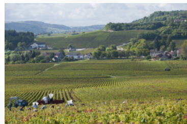
Domaine Ninot vines