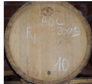
Côtes du Vivarais barrel