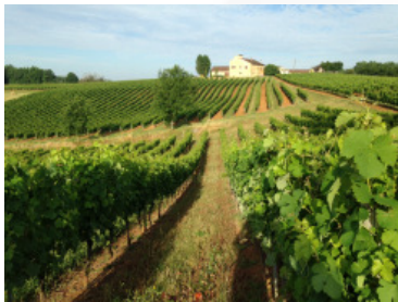
Domaine de Cause Vineyard

This emblematic cuvee from Domaine de Cause comes from 40 years old vines planted in the locality of « La Lande ». Vintage 2010 was designated as second best wine of 2012 by the Wine Enthusiast.